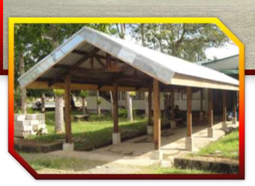
Covered Walk at CE Building